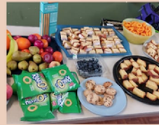
Unlimited tea, cakes and coffee for just £3