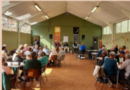
Coach trips, quizzes, musical entertainment + gentle exercise