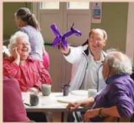
Meet new people

Every Tuesday 10am - 12pm Woodside Baptist Church, 27 Spring Lane